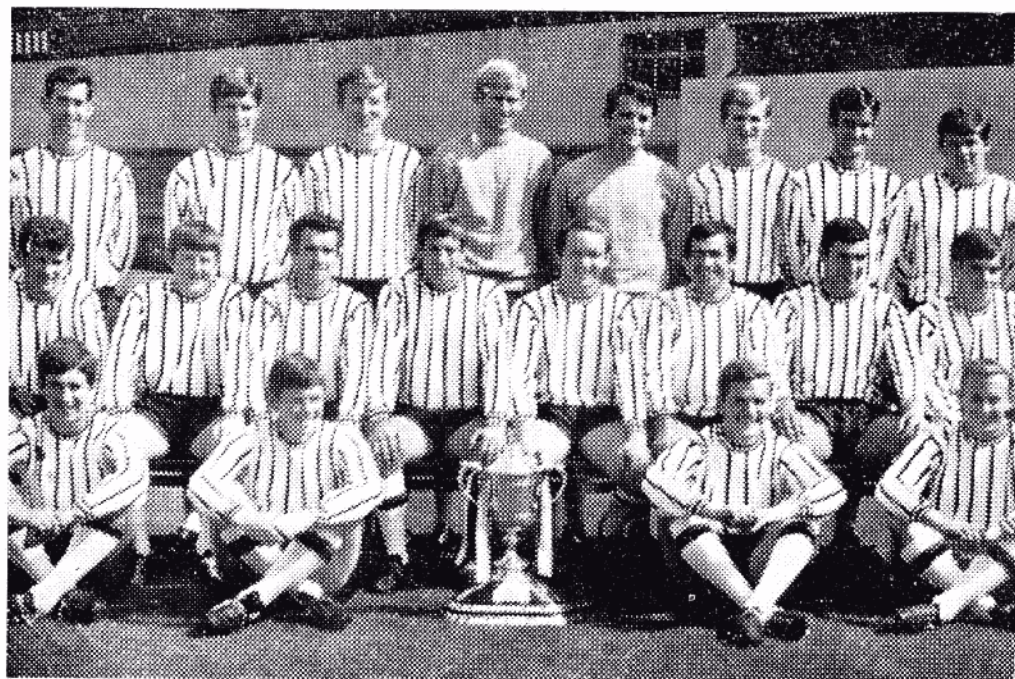
Dunfermline Athletic, Scottish Cup Winners, 1968

So ended the Athletic's first tilt at a European